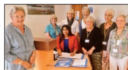
Meeting Friends of Fareham Community Hospital