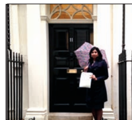
At the Chancellor's door

Residents tell me more services are needed at the hospital. I raised the issue with Health Secretary Jeremy Hunt when he visited in February.