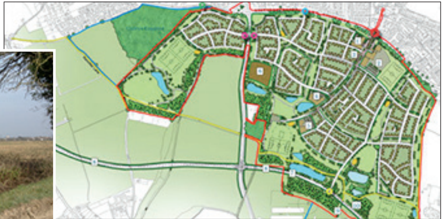
Hands off: Tiffany Harper and resident Fred Birkett discuss the plan to concrete over these green fields.

BATTLE lines have been drawn over a renewed plan to swamp the strategic green gap between Fareham and Stubbington with development.