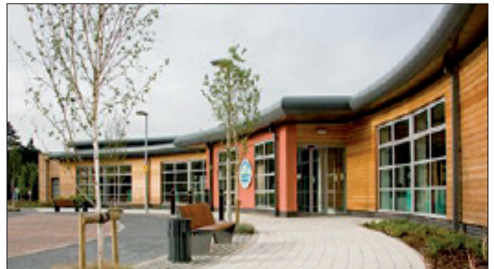
Closed today: Fareham Community Hospital where they work office hours and a 5-day week.

“I want to see effective management in place of bureaucracy and service delivery to respond to need