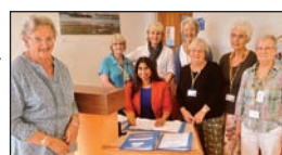
Meeting Friends of Fareham Community Hospital

Residents tell me more services are needed at the hospital. I raised the issue with Health Secretary Jeremy Hunt when he visited in February.