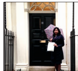
At the Chancellor's door

I joined MPs from all political parties to deliver a letter to Number 11 Downing Street calling on the Chancellor to continue investing in extending broadband coverage.