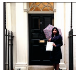
At the Chancellor's door

Residents tell me more services are needed at the hospital. I raised the issue with Health Secretary Jeremy Hunt when he visited in February.