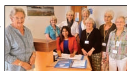
Meeting Friends of Fareham Community Hospital