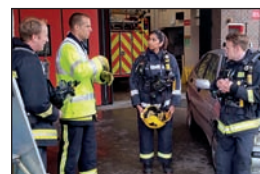
Learning to fight fires