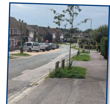
BEFORE - Arundel Dr. now has a fresh road & resurfaced pavements!

Hopefully with these works recently completed it will last for some time. However, residents are requested not to park on the grass verges and whenever possible to use their drives for parking.