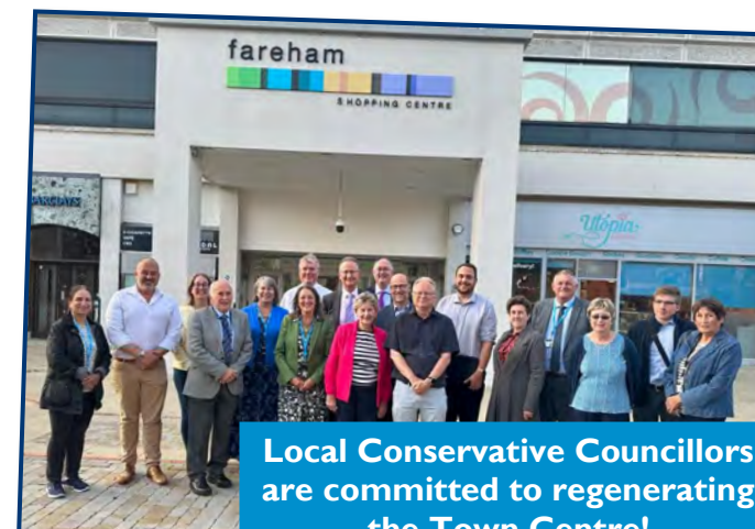
Local Conservative Councillors are committed to regenerating the Town Centre!

The latest addition to Fareham Town Centre will be the new community, arts and entertainment venue of Fareham Live. With a total of almost 1,000 seats, it is already set to become a hugely important asset for the town, with new modern parking alongside.