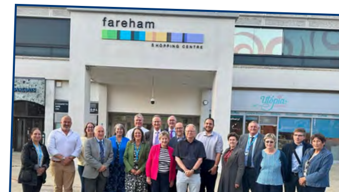
Local Conservative Councillors are committed to regenerating the Town Centre!

The latest addition to Fareham Town Centre will be the new community, arts and entertainment venue of Fareham Live. With a total of almost 1,000 seats, it is already set to become a hugely important asset for the town, with new modern parking alongside.