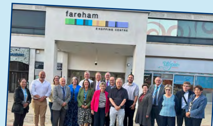
Conservative Councillors are seizing the opportunity to regenerate our Town Centre!

Work will be undertaken over the coming months to create a draft Regeneration Framework for public consultation and partner engagement.