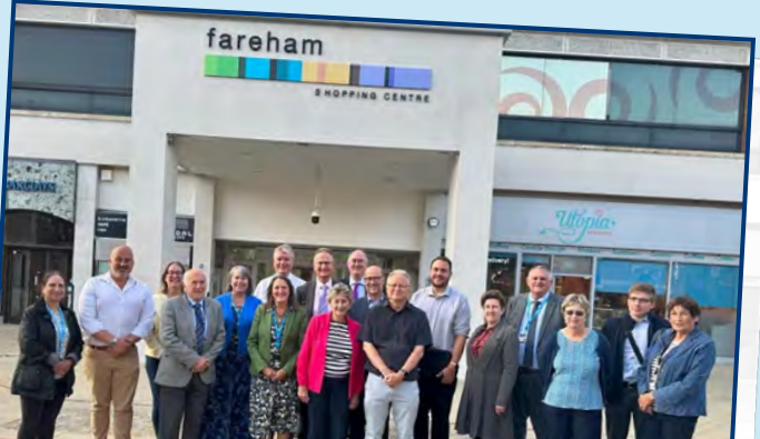
Conservative Councillors are seizing the opportunity to regenerate our Town Centre!

Work will be undertaken over the coming months to create a draft Regeneration Framework for public consultation and partner engagement.