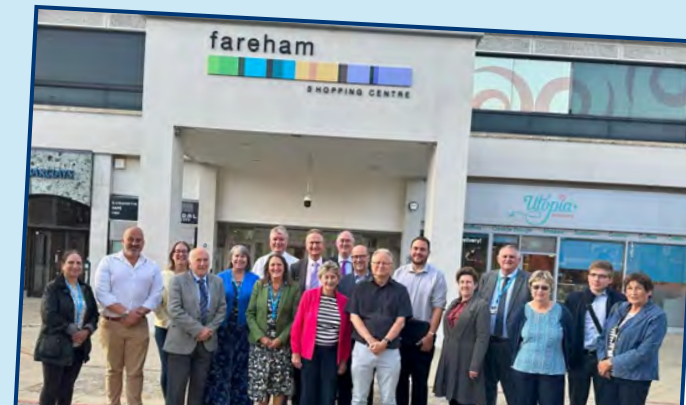
Conservative Councillors are seizing the opportunity to regenerate our Town Centre!

Work will be undertaken over the coming months to create a draft Regeneration Framework for public consultation and partner engagement.