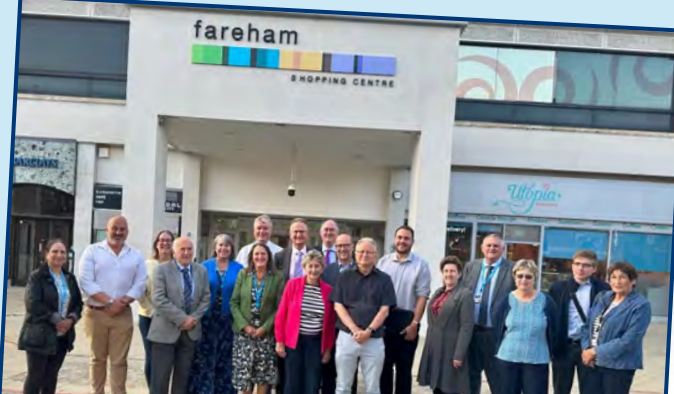
Conservative Councillors are seizing the opportunity to regenerate our Town Centre!

Work will be undertaken over the coming months to create a draft Regeneration Framework for public consultation and partner engagement.