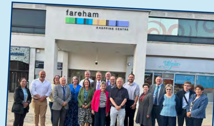
Conservative Councillors are seizing the opportunity to regenerate our Town Centre!

Work will be undertaken over the coming months to create a draft Regeneration Framework for public consultation and partner engagement.