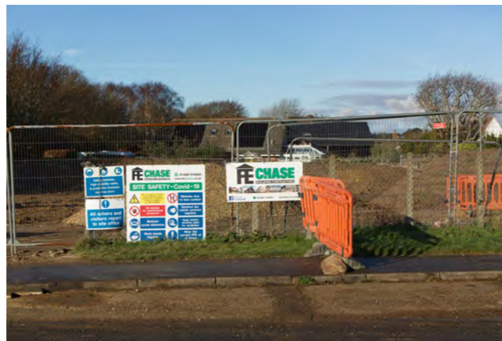
The new entrance from Stubbington Lane into the Capella Close development

Once the building work has started FBC will be releasing details of costs for the purchase of these new shared ownership homes.