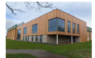
Fareham leisure centre

We will be continuing our massive programme of refurbishment of children's playgrounds and community centres to bring them up to the highest, inclusive standards. In addition we hope to see the Fareham Live entertainment complex built on the site of the old Ferneham Hall to open at the end of next year.