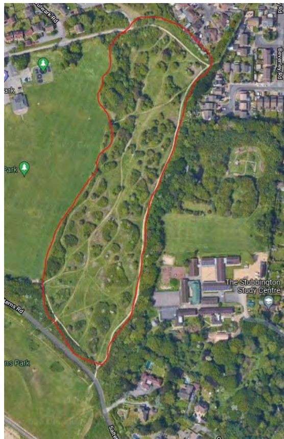
The “Cabbage Patch” outlined in red

The Estates Department have been talking to the MOD about a possible purchase of the leased area and will continue to do so. FBC have contractors who remove unwanted scrub and plant wildflowers under the guidance of our countryside officers.