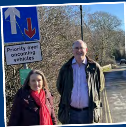
Both our local Borough Councillors are opposed to the permanent closure of Fishers Hill