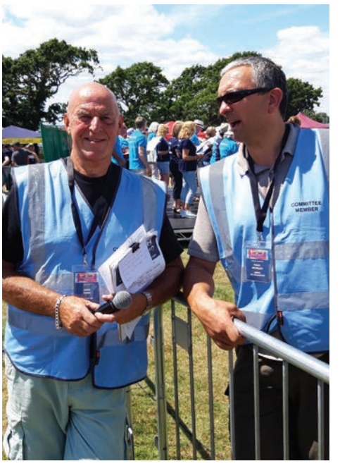
Above: Helping to organise the Warsash Festival and acting as the event's Master of Ceremonies.