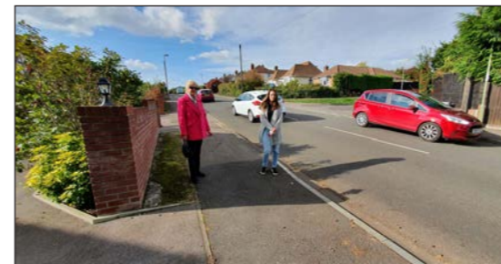
PLEAS for a flashing speed warning sign for

Church Road, Locks Heath have been successful – to the delight of residents.