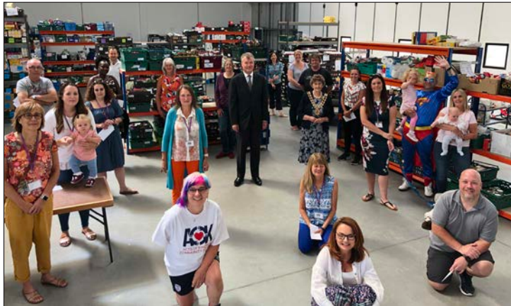
Acts of Kindness volunteers are using one of the business hangars at Solent Airport@Daedalus provided free by the Council.

"Many hundreds of people in need have been helped across the