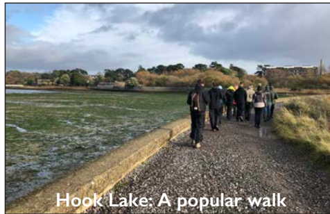
Hook Lake: A popular walk

home will pay no stamp duty. We will also provide £2bn to allow people to apply for a voucher to fund at least two thirds of the cost of upgrading the energy performance of their homes, up to a maximum of £5,000. Low income households will be eligible for up to 100% of Government funding, up to £10,000. This will reduce energy bills by up to £300 per year and help to save carbon.