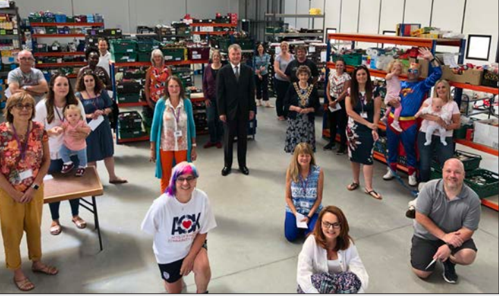
days of World War 2 surfaced Acts of Kindness volunteers are using one of the business hangars at Solent Airport@Daedalus provided free by the Council. Community and Portchester Community Association.

"Many hundreds of people in need have been helped across the