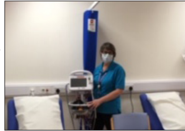
The Community nurses are also based in the Fareham Community Hospital.

teams of nurses who manage patients dialysing at home on two different types of renal dialysis.