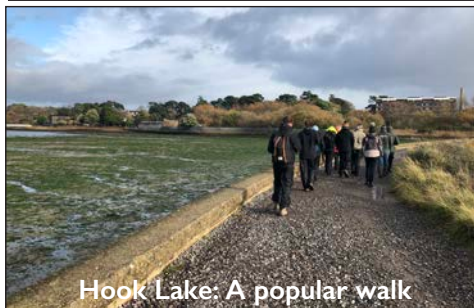
Hook Lake: A popular walk

This will reduce energy bills by up to £300 per year and help to save carbon.