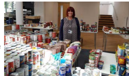
The church did not want to step on the toes of Acts of Kindness who already offer a food bank service,

Waypoint has been receiving donations of food and money and the Council gave a £5,000 grant for the cause.