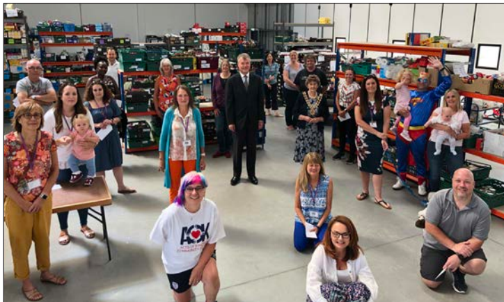
Acts of Kindness volunteers are using one of the business hangars at Solent Airport@Daedalus provided free by the Council.

"Many hundreds of people in need have been helped across the