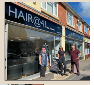
lill and lackie had to take extra precautions before reopening Hair@41 hairdresser's