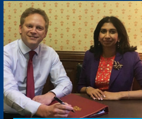
Suella discusses smart motoryways with Secretary of State for Transport, Grant Shapps

You can read my recent speech on local transport issues where I raised these matters directly with Ministers here: http://bit.ly/suellatransport