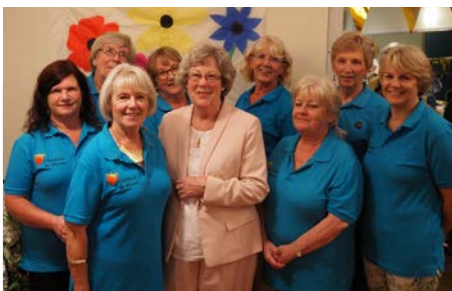
VOLUNTEERS are pictured celebrating at an awards evening in Titchfield Community Centre.