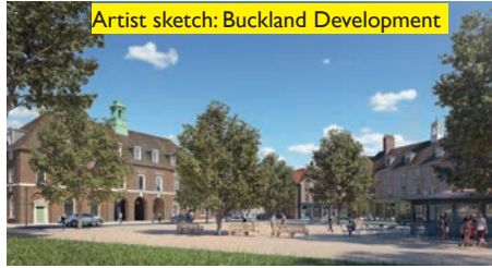
Artist sketch: Buckland Development

There is a possibility for a new rail station to serve the community.