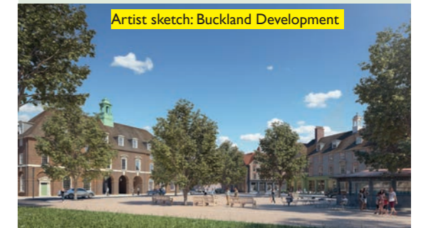
Artist sketch: Buckland Development

A NEW community north of Fareham moved a step closer when Council planners granted outline consent for Welborne Garden Village.