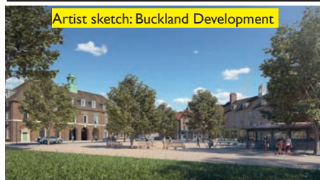
Artist sketch: Buckland Development

The examination timetable is up to the Inspectorate but should be over the autumn – winter period, allowing formal Council adoption of the plan in early 2021.