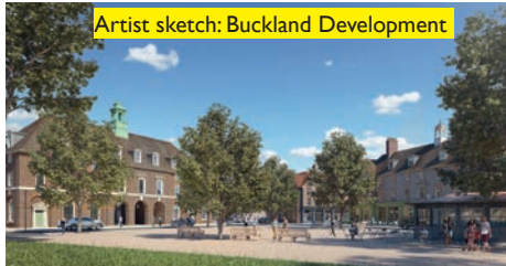
Artist sketch: Buckland Development

A NEW community north of Fareham moved a step closer when Council planners granted outline consent for Welborne Garden Village.