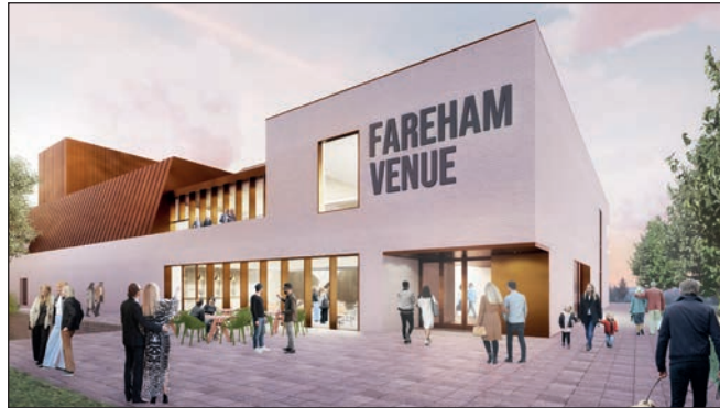
Vision: Artist's sketches of the remodelled Ferneham Hall and (below) the spacious foyer.