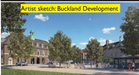
Artist sketch: Buckland Development

brand new community, arts and entertainment venue will bring residents into Fareham and be a vibrant venue in the town centre."