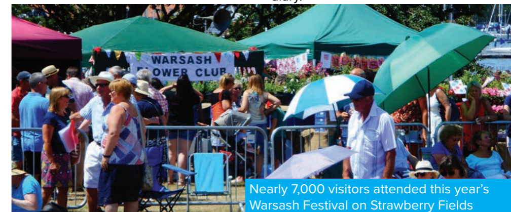
Nearly 7,000 visitors attended this year's Warsash Festival on Strawberry Fields

The next Festival is scheduled for 2021, so remember to put 3 July 2021 in your diary.