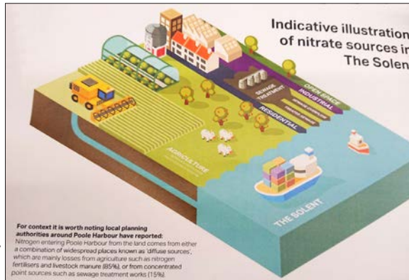
For context it is worth noting local planning authorities around Poole Harbour have reported: Nitrogen entering Poole Harbour from the land comes from either a combination of widespread places known as diffuse sources, which are mainly losses from agriculture such as nitrogen fertilisers and livestock manure (85%), or from concentrated point sources such as sewage treatment works (15%).

In less than a year, yet more green fields have come under threat after Whitehall demanded that Fareham finds space for up to 2,500