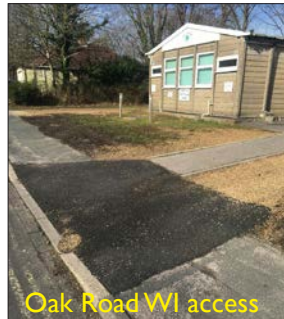
Oak Road WI access

A BADLY damaged kerb caused difficulties for the wheelchair access of an elderly lady in Meadowbank Road.