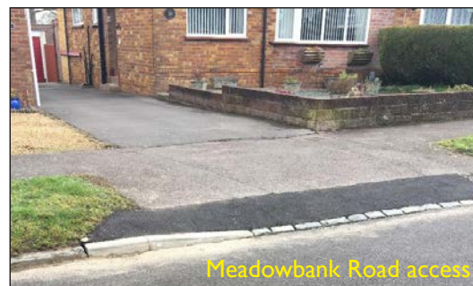
Meadowbank Road access

Tina was also thanked for getting similar work done for the Women's Institute in Oak Road.