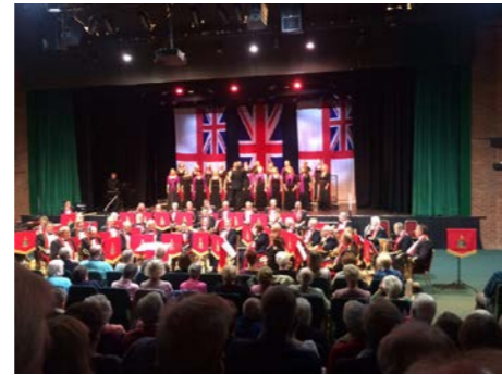
Rule the World and Poppy Red.

The band, conducted by Lieutenant Colonel