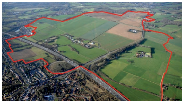
The new garden village at Welborne, north of Fareham will help us meet our commitment to build 8,000 new homes.

We will deliver as much affordable housing as possible including council housing, shared equity housing, discounted and even self-build homes.