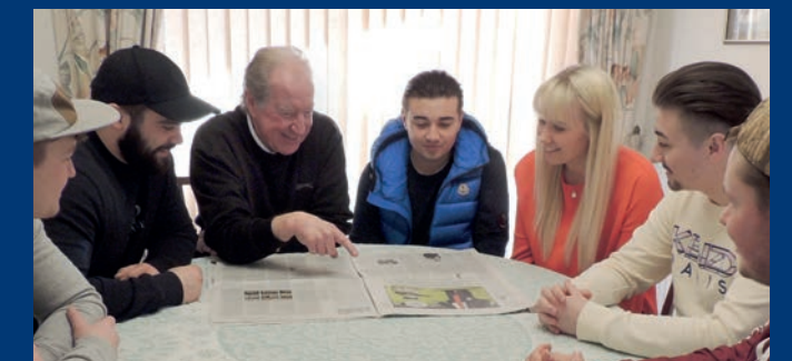
Discussing the issues affecting our younger generation