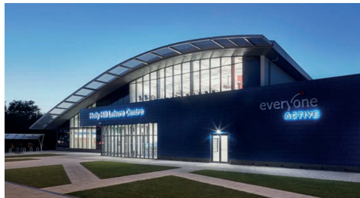
Holly Hill Leisure Centre is used by hundreds of people every week.

As Chairman of the Working Group, I was very pleased to deliver the Holly Hill Leisure Centre and Coldeast Play-park. This is an amazing facility that delivers both for residents of Warsash and surrounding areas.