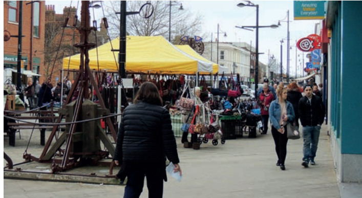
Fareham continues to be a popular place to live and work

We will continue to pursue the introduction of better broadband in areas where internet speed is still unacceptably low.