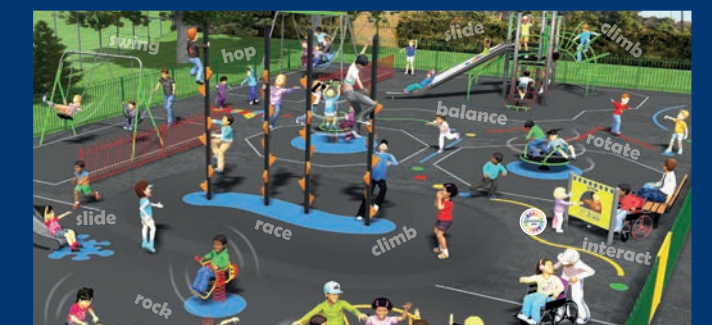
Artists impression of the new playground for Warsash

Conservatives spend every penny of your money wisely - that's why you pay one of the lowest district council taxes in the country.