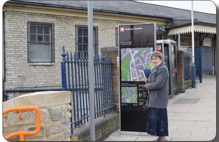
Inspecting some of the recent improvements to Fareham station approach carried out in conjunction with major works to the roundabout and The Avenue to improve traffic flows.