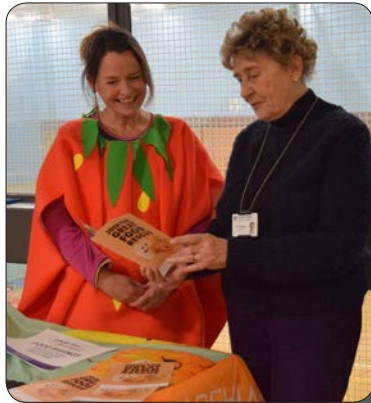
Meeting the food champion who works with FBC to promote the Love Food, Hate Waste campaign.