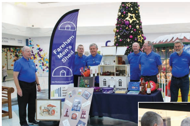
FMS members' Christmas draw stand.

"The Shed is somewhere to meet and make new friends. Whether it is just for a chat and a cup of tea or to