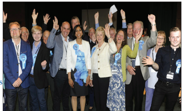
Victory: Conservatives celebrate an historic win by Suella after the count at Ferneham Hall on June 8.

Nationally, we would have liked a better