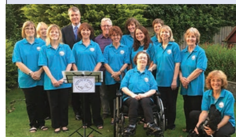
SIGN4FUN – sign music for the hard of hearing - receive £900 for sweatshirts and a music system.

Worthy causes grants County Councillor Seán Woodward has £8,000 available for grants to worthy causes in Sarisbury Division. Last year, he awarded the following: •Cage 4 All CIC - living well with dementia through cricket £500 •Y-Services bus £6,000 •Swanwick Seals sauna £600 •Bursledon Brickworks wildlife garden refurbishment £500 •Whiteley Community Pre-school sensory garden £1,000