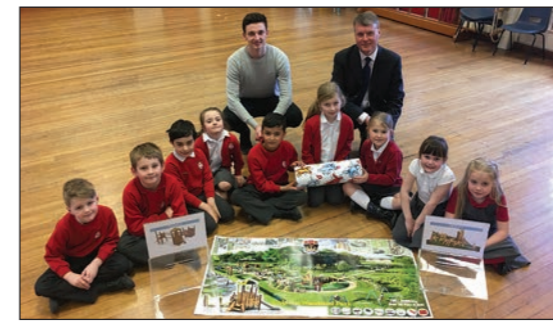
"We will hopefully all be coming back to dig up the time capsules and they will be able to explain their treasures to their own children in 2042."