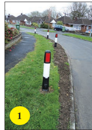
VEHICLES are continuing to cause damage where they shouldn't be driven – on pavements and verges.