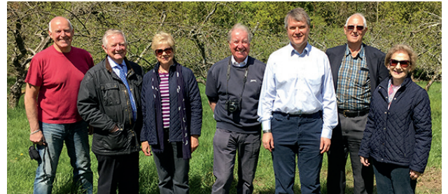
Tranquil: The beautifully restored pond. Above: Past and present councillors admire the orchard.