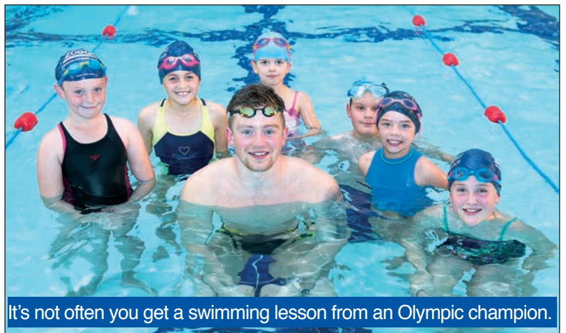
It's not often you get a swimming lesson from an Olympic champion.