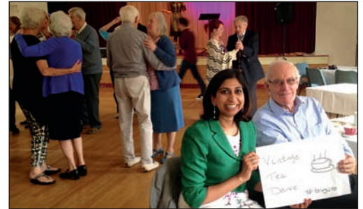
I found these seniors enjoying the Fareham & Gosport Dementia Action summer tea dance.

Many activities will be on offer such as physiotherapy and sports massage tasters, tailored advice from a pharmacist, a Zumba Gold taster class aimed at ladies over 50, information on health and clinical trials by Cancer Research UK.