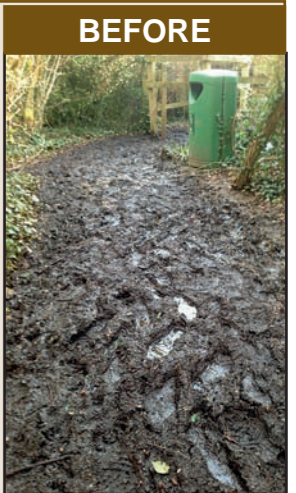
BEFORE You'd be lucky to keep your wellies in this.

Council officers will also be undertaking autumn clearance of the drainage ditches running alongside the greenways to keep them free-flowing.