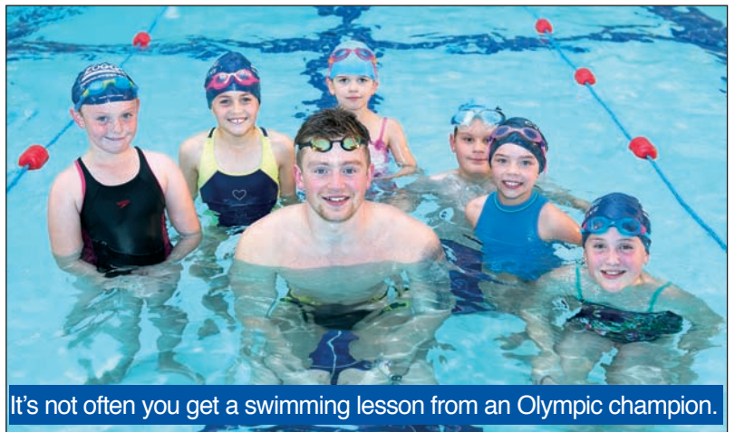
It's not often you get a swimming lesson from an Olympic champion.