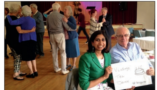
I found these seniors enjoying the Fareham & Gosport Dementia Action summer tea dance.

Many activities will be on offer such as physiotherapy and sports massage tasters, tailored advice from a pharmacist, a Zumba Gold taster class aimed at ladies over 50, information on health and clinical trials by Cancer Research UK.