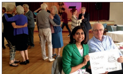
I found these seniors enjoying the Fareham & Gosport Dementia Action summer tea dance.

Many activities will be on offer such as physiotherapy and sports massage tasters, tailored advice from a pharmacist, a Zumba Gold taster class aimed at ladies over 50, information on health and clinical trials by Cancer Research UK.